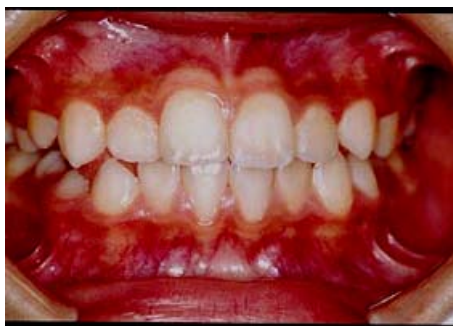
Fig2. Clinical findings at the age of 9 years and 1 month, Right permanent incisor had white spots of the labial Surface.

root resorption was detected. Furthermore, there were no X-ray images in which the resorption of the alveolar bone around the root was suspected. In this day, splint was removed, and the degree of tooth mobility was measured using a Dental Mobility Checker (Yoshida Co.). As a result, the degree of the mobility of the replanted maxillary right primary central incisor was 4.7, and that of the maxillary left primary central incisor was 3.3.