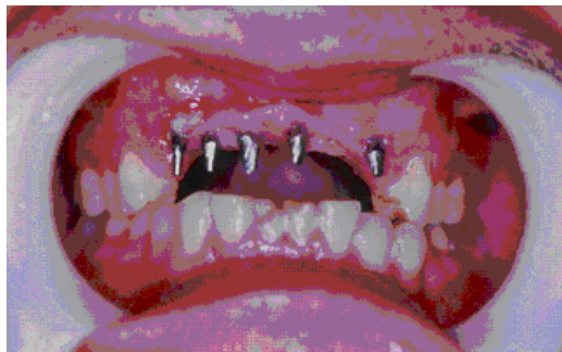
Fig.3. 5 implants placed in partial edentulous