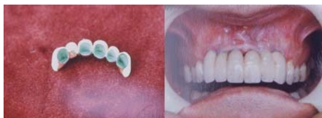
Fig.4. Restoration been made