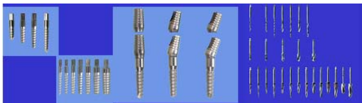
Fig 1.JIAD(KOM) implant and drill