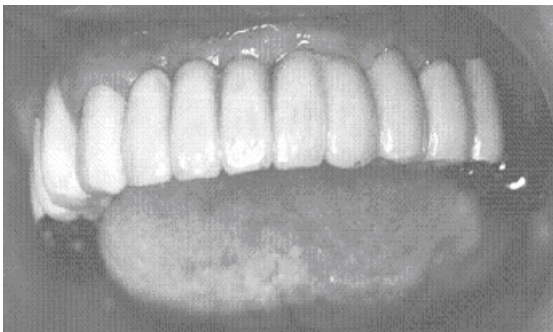
Fig 5. Noble-metal-ceramic