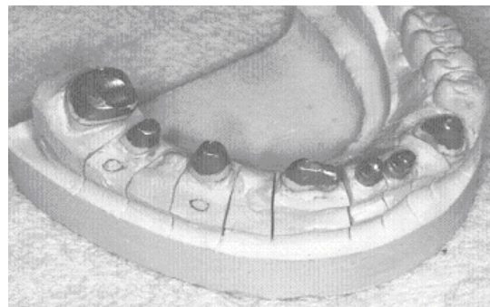
Fig 2. Intraoral view of surgery