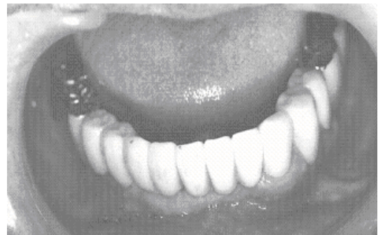
Fig 6. Noble-metal-ceramic

100% survival rate achieved in the present study may be attributed primarily to optimal initial stability and to the surface characteristics of the implants. Preparation of the osteotomy site to a width that was always smaller than the final implant implants were sured primary stability by nature teeth. It has been pointed out that implants in extraction sites are more sensitive to early losses at immediate loading, although this is not statistically significant[7].