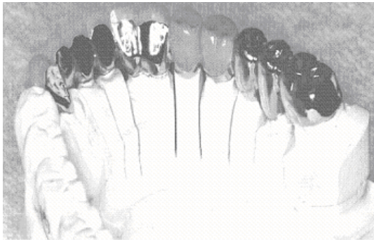
Fig 3. Retrospective been marking