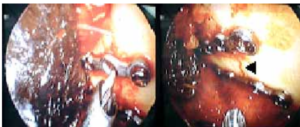
Figure 2. Fixation as visualized through the endoscope. Black arrow points to the fracture line.

“This study was supported by a grant of the 21C New Frontier R&D Project (M105KO010001-05K1501-00110 )”