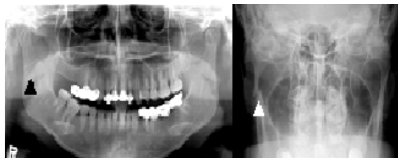
Figure 1. Preoperative panoramic and modified Towne’s radiograph showing right subcondylar fracture (arrow )

* Fracture pattern –MacLennan’s classification