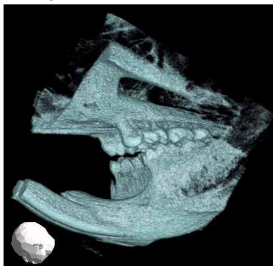
Fig.3 Volume rendering image The image provide three dimensional very clearly.

In the near future, this system will be used widely for in vivo research.