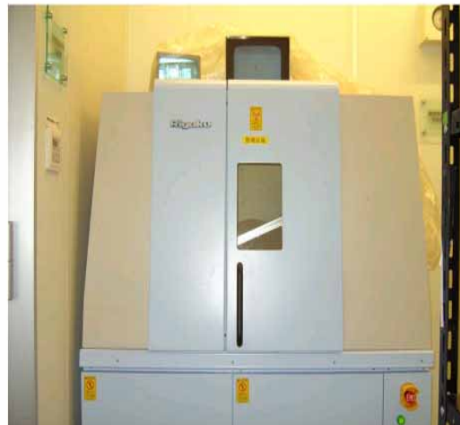
Fig. 1 Overview of new micro CT

The three-dimensional volume-rendered images are very clear, depicting the teeth and jaw bone structures. Using this system, individual animal can be followed to observe growth and aging, because the animal is not affected by this examination. Serial data are very important for research of trauma and regeneration.